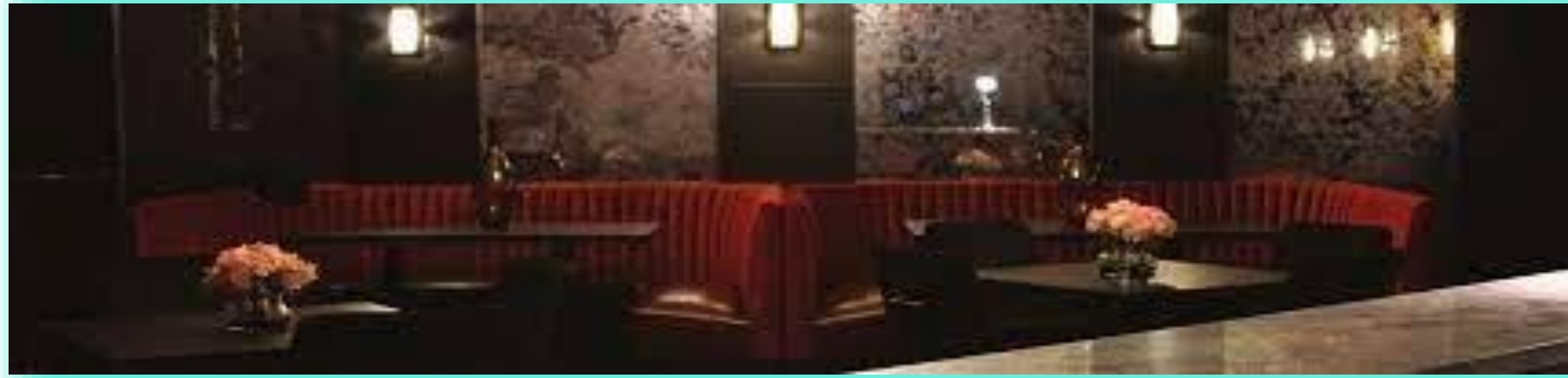
The Robert Shaw Room